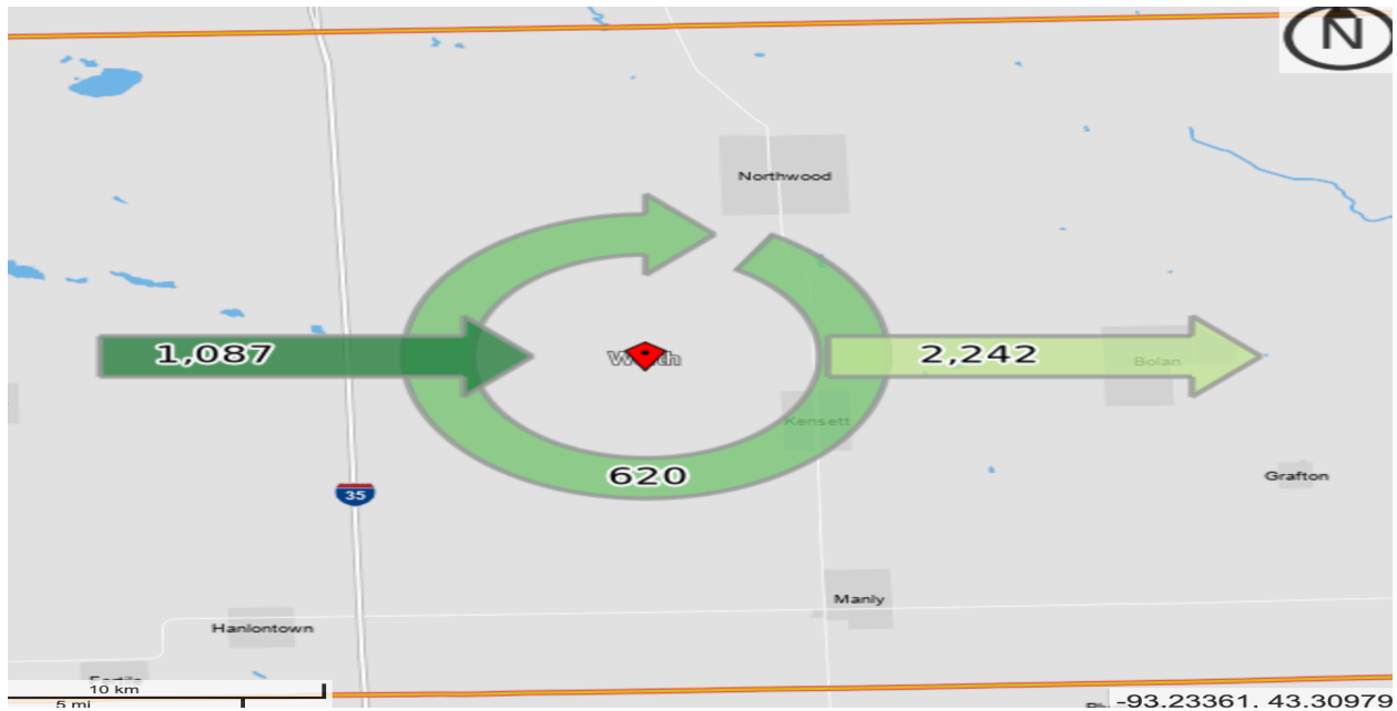
Figure 1: Worth County Workforce Commuting Pattern